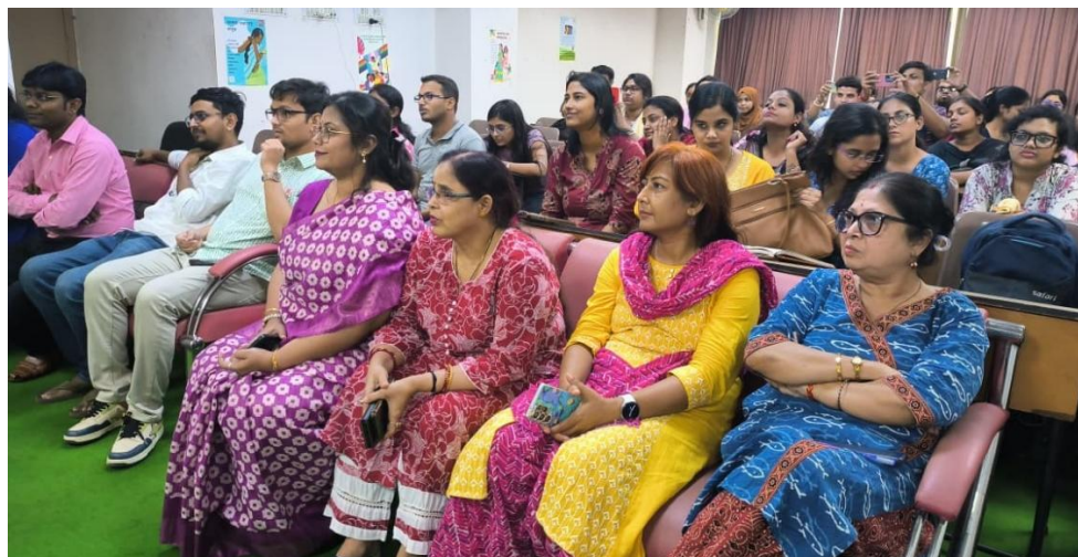
Faculty and students of CDOE RBU attending the seminar