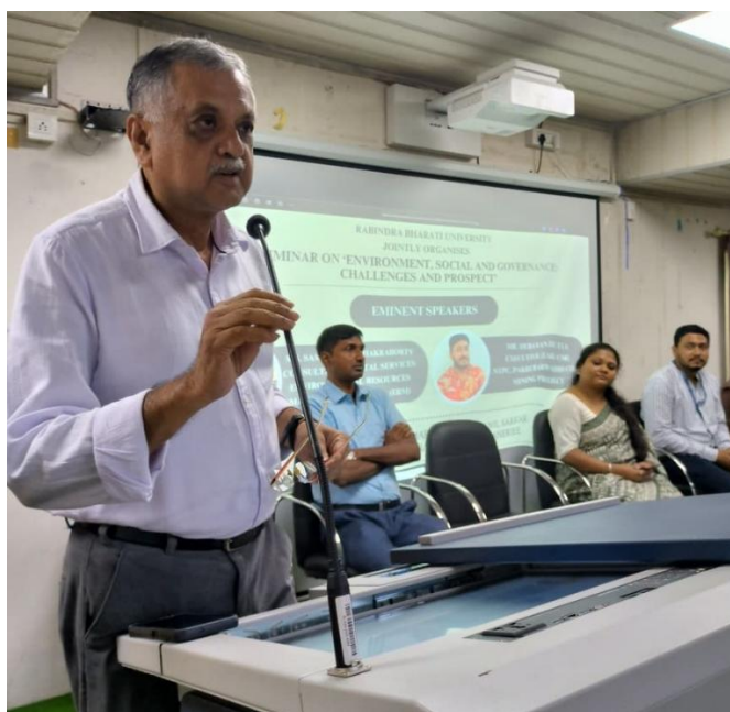
Director, CDOE RBU, delivering the welcome address of the seminar

The welcome address of the seminar was delivered by The Director, CDOE RBU, whereby he highlighted the significance of this event and introduced the theme for the same.